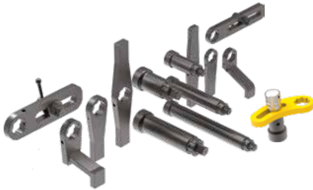
BTW-Series accessories for further extending the application range. ►